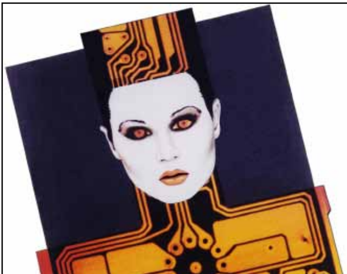
Flexy Surface Mount Deena Des Rioux Computer montage / Duraflex Photo

'Silly Faces" an interactive video installation that asks the audience to become a part of the exhibit will be showcased in our Tranovich Gallery March through May. In this humorous piece, visitors instantly upload a 5-second video of themselves into a kiosk. Then the most recent video is added to the constantly changing grid display of videos projected onto the gallery wall. Each video is bumped to the left when a new video is created, resulting in an animated and evolving mosaic.