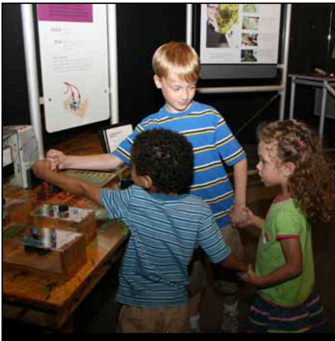
Science & Art Exhibition

Paper is transformed into breathtaking sculpture, large-scale installations and conceptual works that express contemporary social, political, and aesthetic ideas. Rooted in the ceremonial world, origami dates back to the 6th century AD Japan and China. This spectacular exhibition is organized into four sections moving from its origins to today with its major influence on science, industry, fashion and beyond.