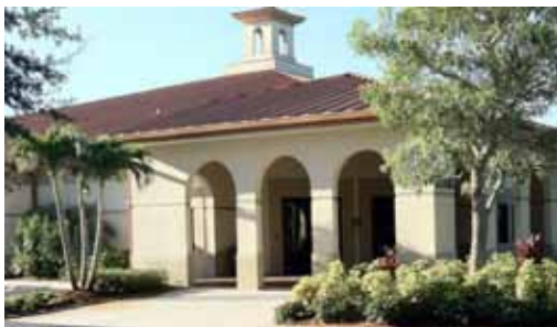
Center for Performing Arts