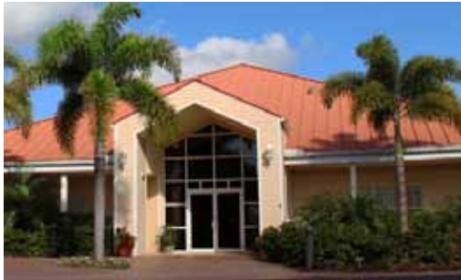
Center for Visual Arts

A place for all seasons and all ages, we provide year round programs for everyone in art, theater, music and dance. Join us and enjoy all we offer.